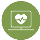
nGeniusPULSE Testing from anywhere