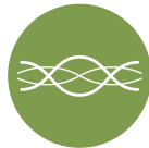
Smart Data Analytics